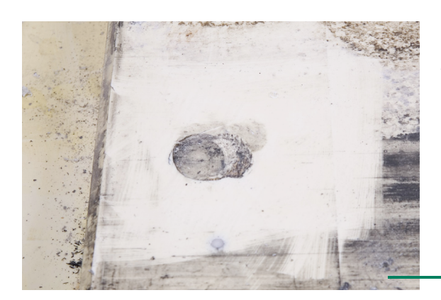
Area around damage after cleaning