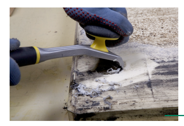
1. Clean ASSYX DuroBOARD® around the damage with Handscraper. ATTENTION:

Use protective goggles and protective gloves!