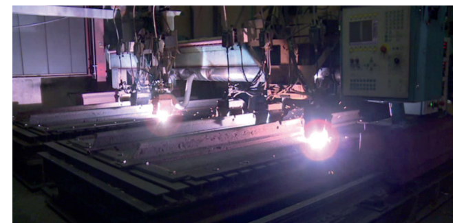
THE WEAR PROTECTION MANUFACTORY